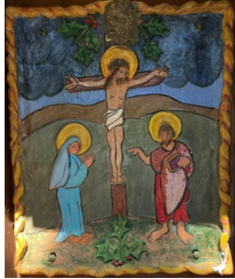
Tile featured from station 12 on the Nature Trail.