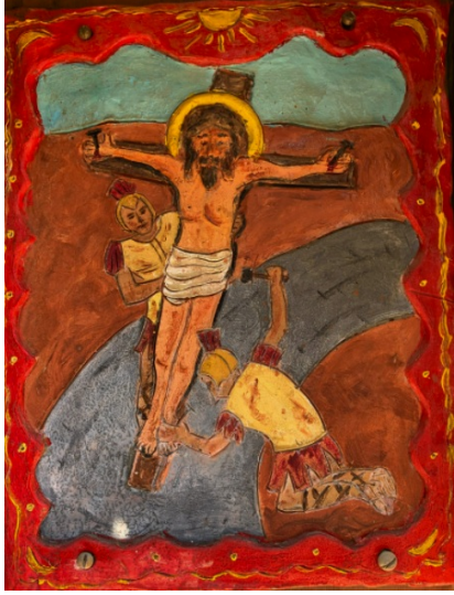
Tile featured from station 11 on the Nature Trail.