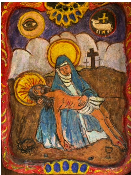
Tile featured from station 13 on the Nature Trail.